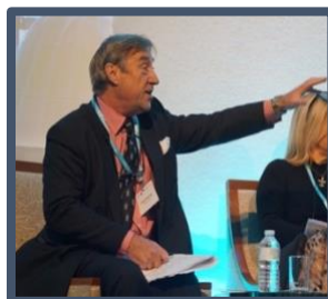
Chairing at the HOSPA Conference 2019