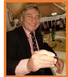
Folding raffle tickets at the Dorchester Fishing Club, the oldest fishing club in England