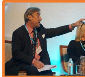
HOSPA Conference 2019