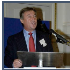
Interviewing the Indian High Commissioner at The London Press Club