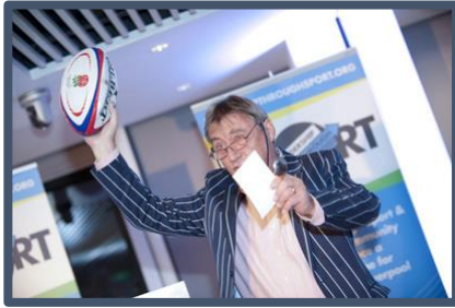
Auctioneering for Leadership Through Sport