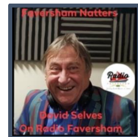
Presenting on Radio Faversham