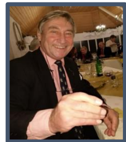
Folding raffle tickets at the Dorchester Fishing Club, the oldest fishing club in England